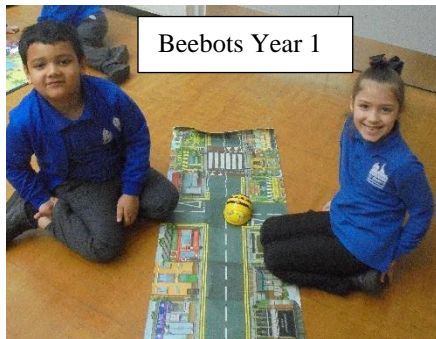
Beebots Year 1

Over the Spring Term, the children of St Mary's children have had the opportunity of exploring and mastering different computing programs. We are fortunate enough to work in collaboration with Camden Learning Centre (also known as CLC), this means we have the opportunity of highly trained computing experts assist teacher's in delivering a high-quality computing curriculum. Across the school, children worked with a variety of different programs to help them with coding and animation to make a variety of different games with varying complexity: chatterkid, beebots, scratch junior and scratch.